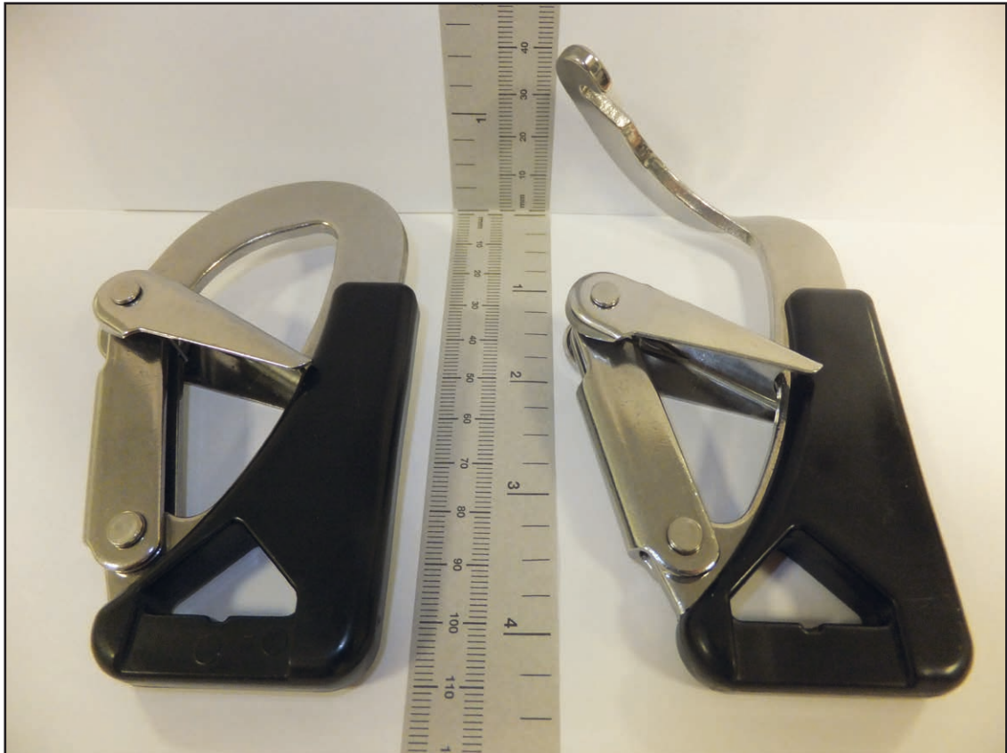
Figure 2: Example of a tether hook and a tether hook after lateral loading